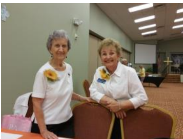
Happy Hostesses wearing sunflowers!