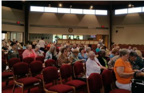
Christ Venice Sanctuary